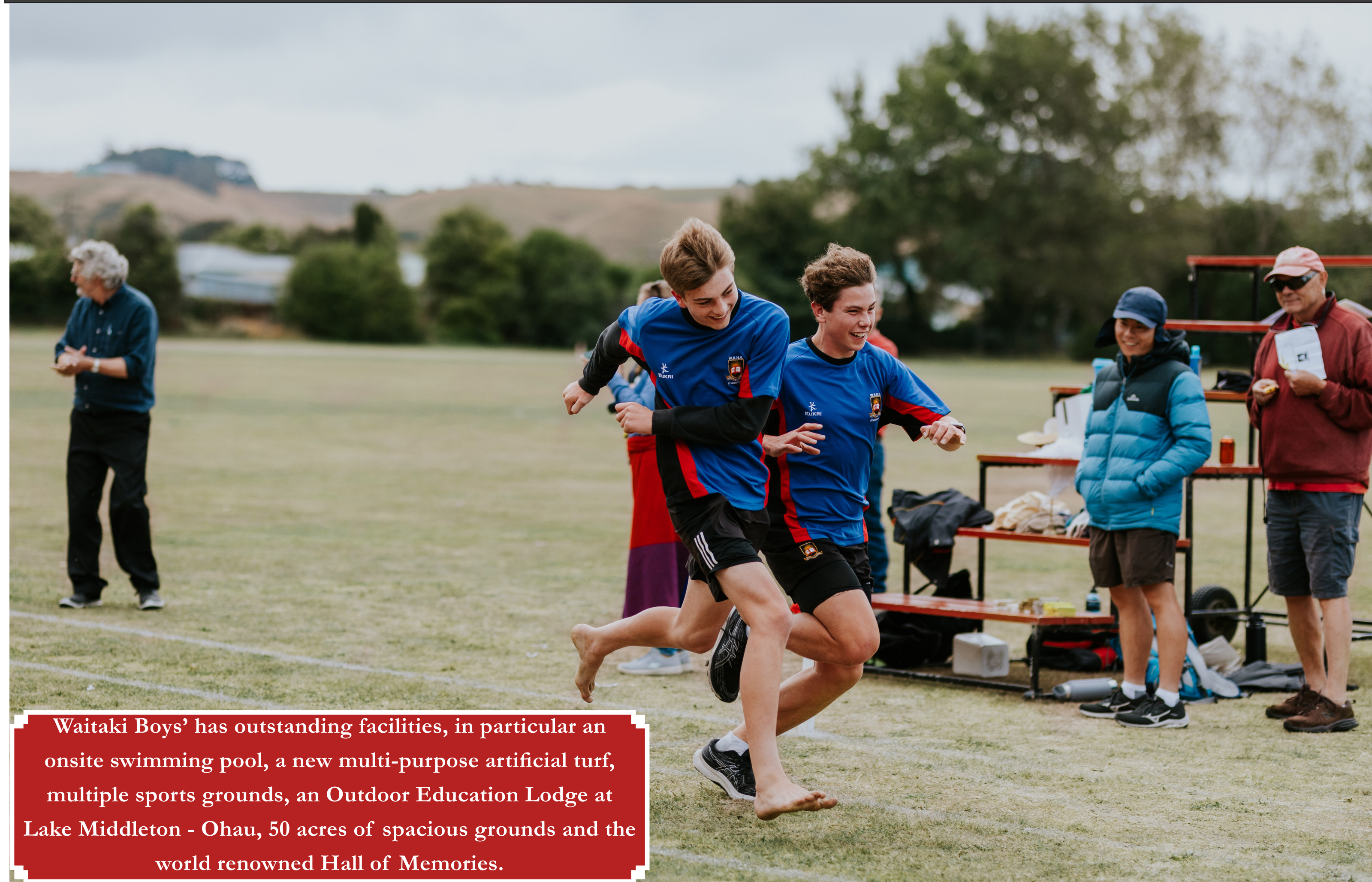
Waitaki Boys' has outstanding facilities, in particular an onsite swimming pool, a new multi-purpose artificial turf, multiple sports grounds, an Outdoor Education Lodge at Lake Middleton - Ohau, 50 acres of spacious grounds and the world renowned Hall of Memories.